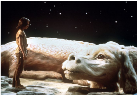
Constantin © (1984) All rights reserved.